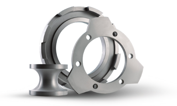
Guide rollers and bearings for milling applications

These properties make Kyocera's sintered silicon nitride the preferably selected material for complex structures and precise geometries in lightweight structures, optical systems or wear parts.