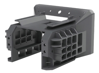
Structural frame for measurement optic used for semiconductor applications