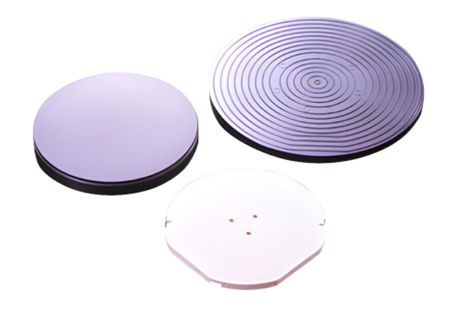
Vacuum chucks and integrated mirros for space applications